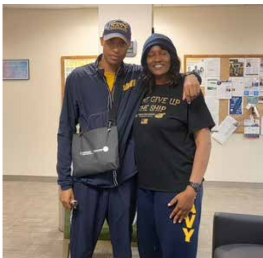
Cancer patient and wife as he is treated for his illness at Walter Reed.